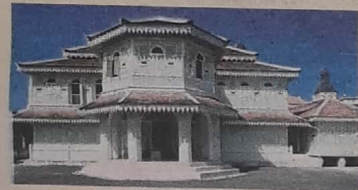
The Kelantan Islamic Museum boasts more than 350 collections.

In fact, the Sultan Ismail Petra Arch was constructed to commemorate the occasion when Kelantan was announced as a cultural state showcasing Malay culture.