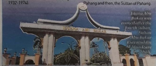
Istana Abu Bakar was named after the fourth sultan, Sultan Abu Bakar Riayatuddin Al-Muadzam Shah.

Also located in Pekan is the State Museum, known as Sultan Abu Bakar Museum. This is where visitors should head to get a better understanding of Pahang's history. More than a century old, the museum was once the official residence of the British resident in Pahang and then, the Sultan of Pahang.