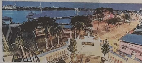
An aerial view of the riverine Royal Town of Muar.

While visiting the mosque, don't forget to catch an old but still functioning sundial on the grounds.