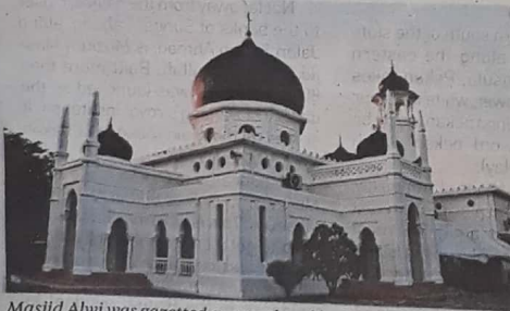
Masjid Alwi was gazetted as a national heritage in 2009.