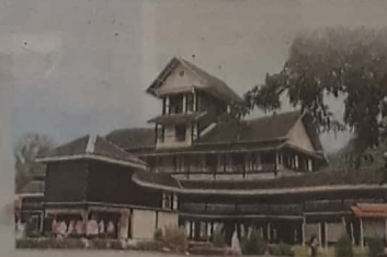
Distinctive Minangkabau elements can be seen at Istana Lama, the former abode of the Negri Sembilan ruler.

Worth checking out while in Seri Menanti is Ladang Alam Warisan, which is known for its equine activities and landscape.