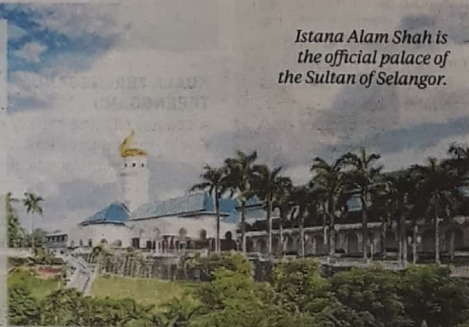
Istana Alam Shah is the official palace of the Sultan of Selangor.

Besides housing the Royal Mausoleum for the state's royal family, this mosque is famous for its unique combination of architecture (not found anywhere else in the country) that ranges from Moorish to English, Neoclassical and Western art deco styles.