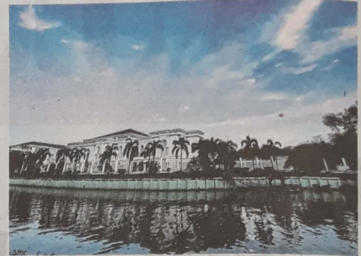
Istana Anak Bukit sits on the eastern bank of Sungai Anak Bukit that flows down to Alor Setar to meet Sungai Kedah.