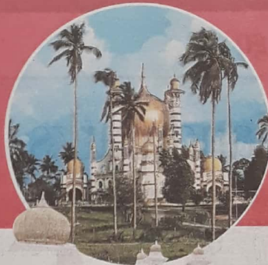
Masjid Ubudiah in Perak is one of the many symbols of Islamic heritage. BELOW: Iskandariah Palace, situated on Bukit Chandan, is the official residence of the Sultan of Perak.