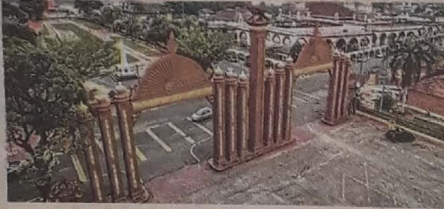
The Sultan Ismail Petra Arch is one of the prominent sculptures in Kota Baru.